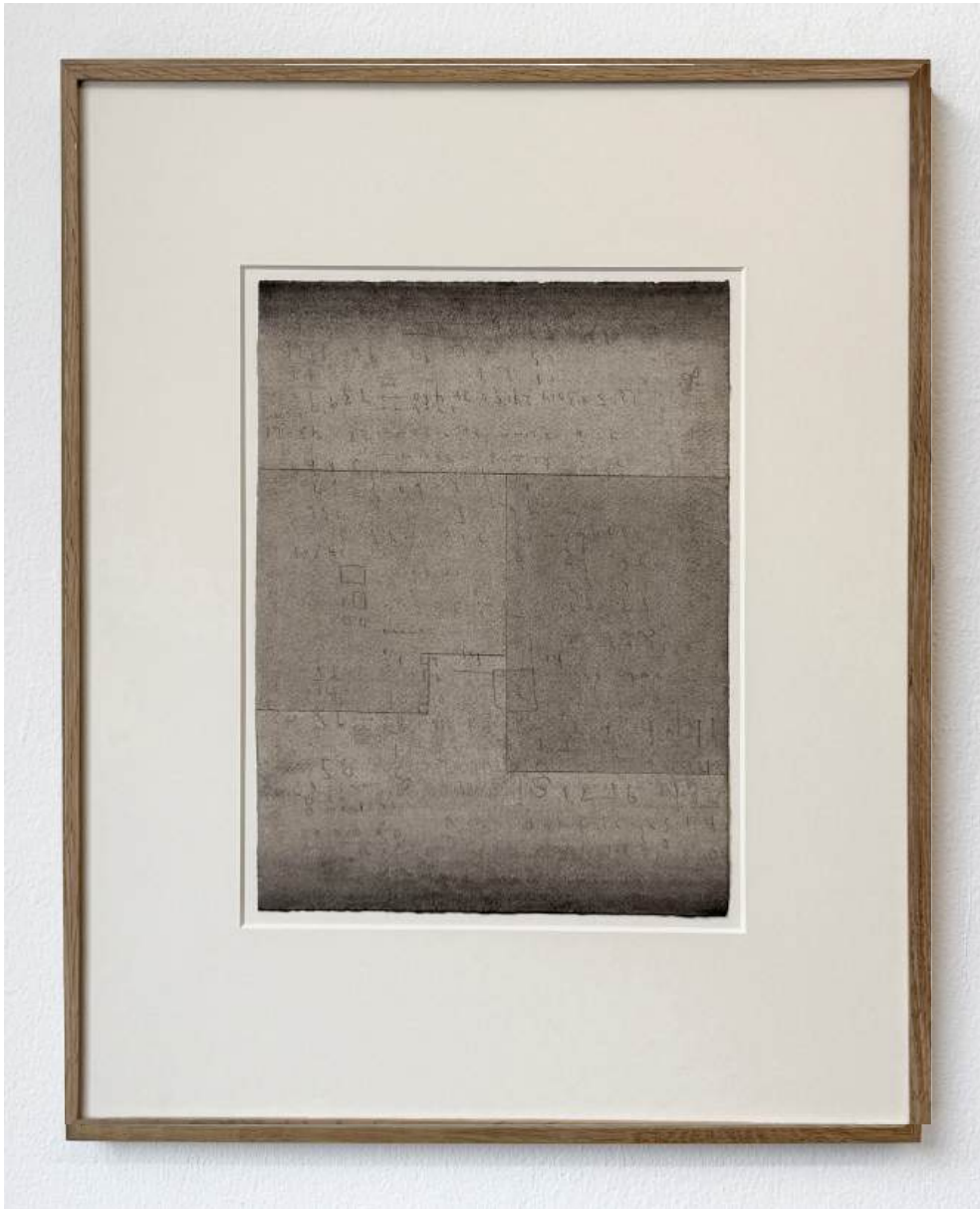
Simon Callery, „Drawing as Explanation“, 2025 Gouache and pencil on paper, 37.9 x 28.3 cm