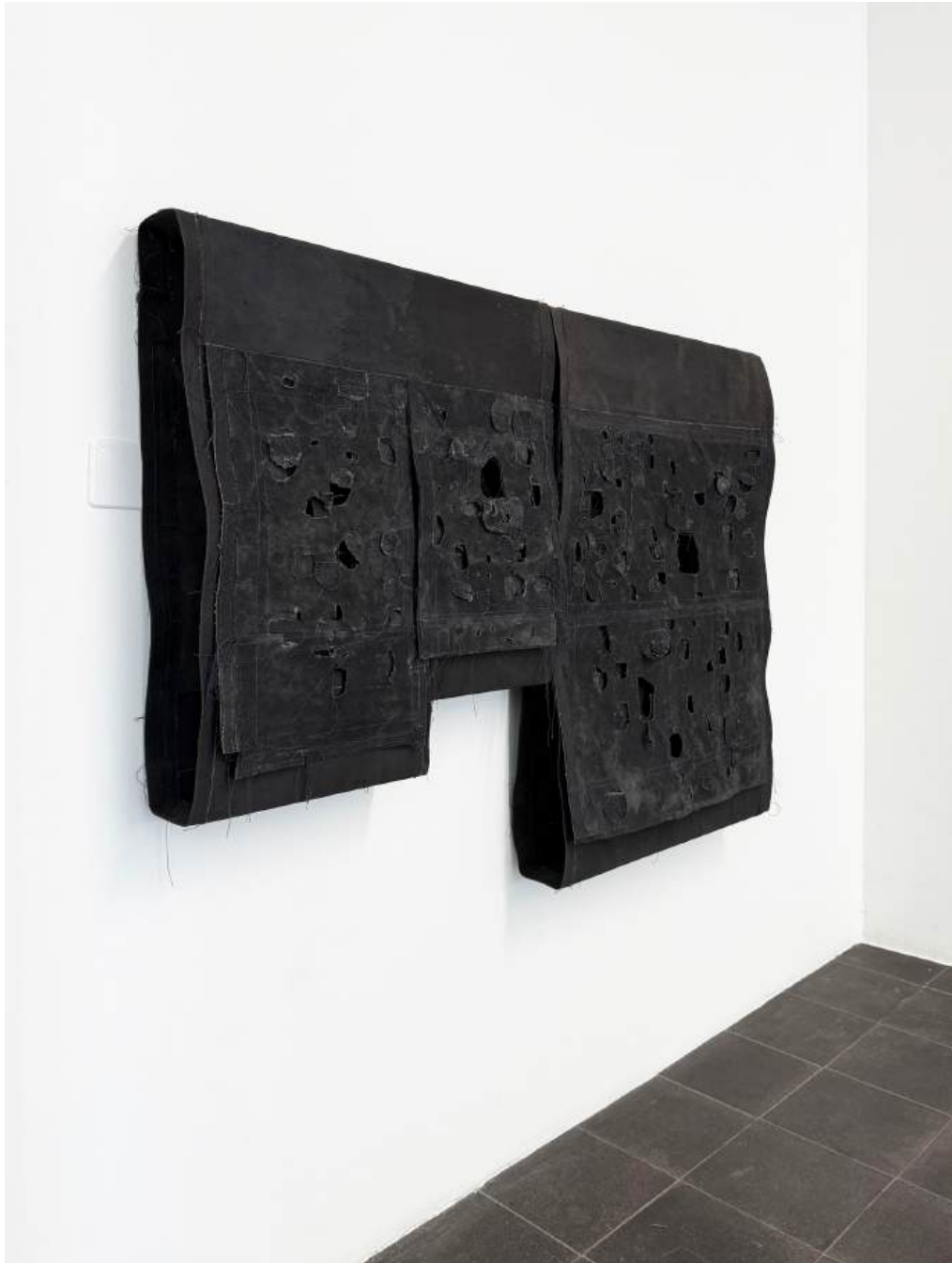
Simon Callery, „Limehouse Night Painting (steps)“, 2025 Canvas, distemper, thread, aluminium, wood, 98 x 129 x 12 cm