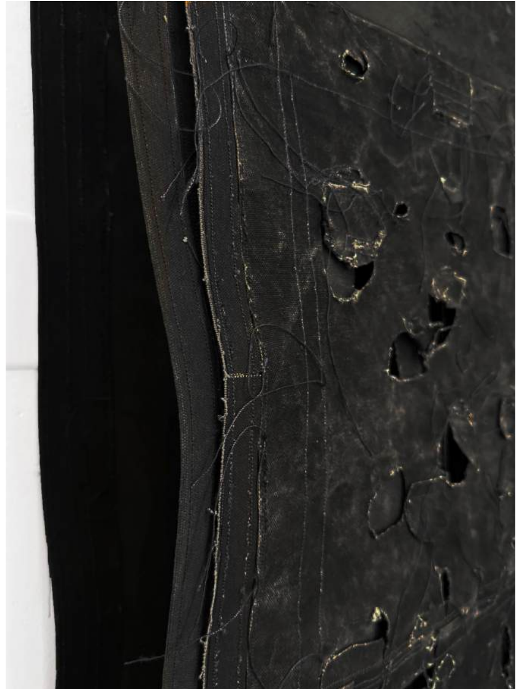
Simon Callery, „Limehouse Night Painting (steps)“, 2025 , Detail Canvas, distemper, thread, aluminium, wood, 98 x 129 x 12 cm