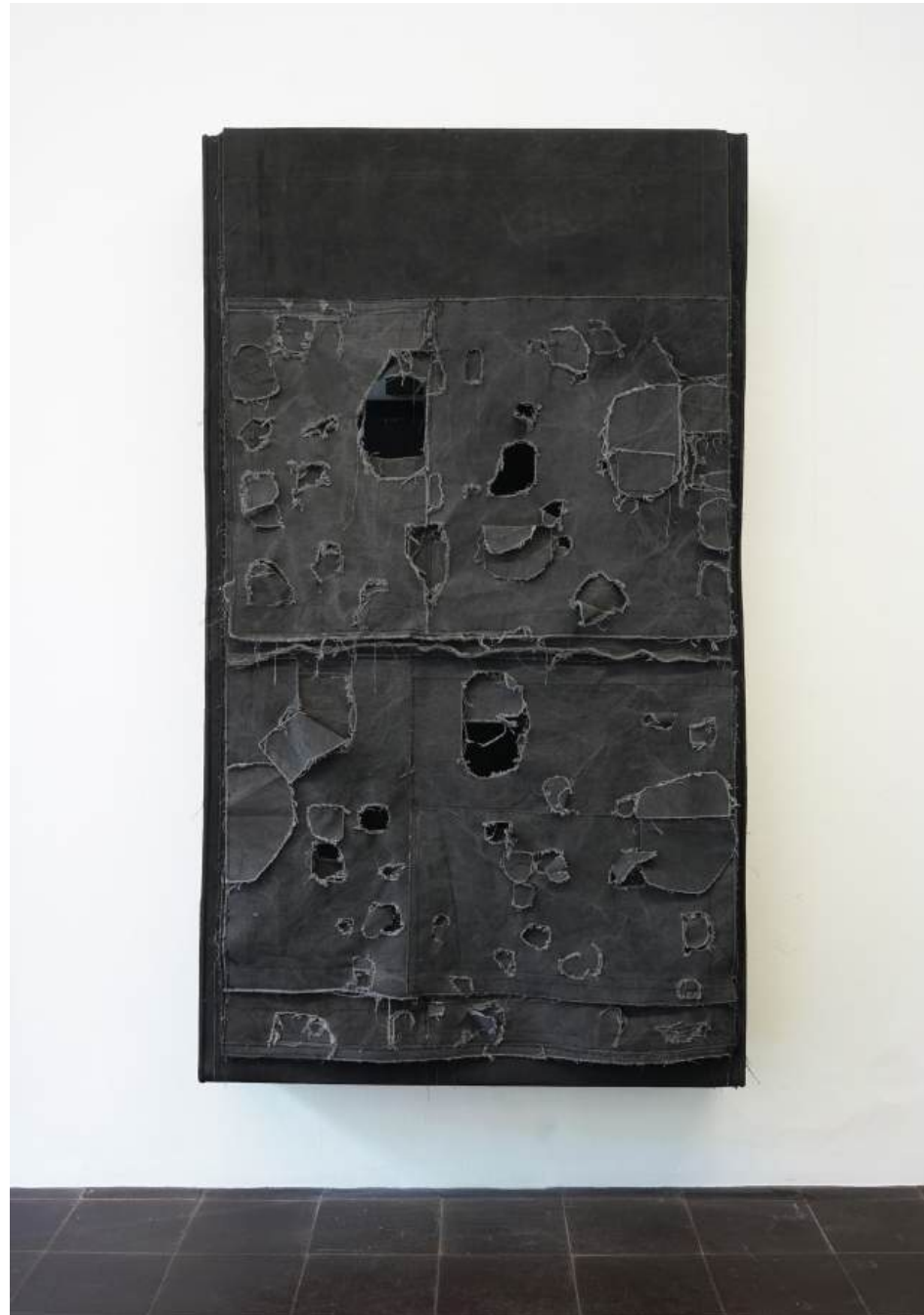
Simon Callery, „Limehouse Night Painting“, 2025 Canvas, distemper, thread, wood, 185 x 105 x 29 cm