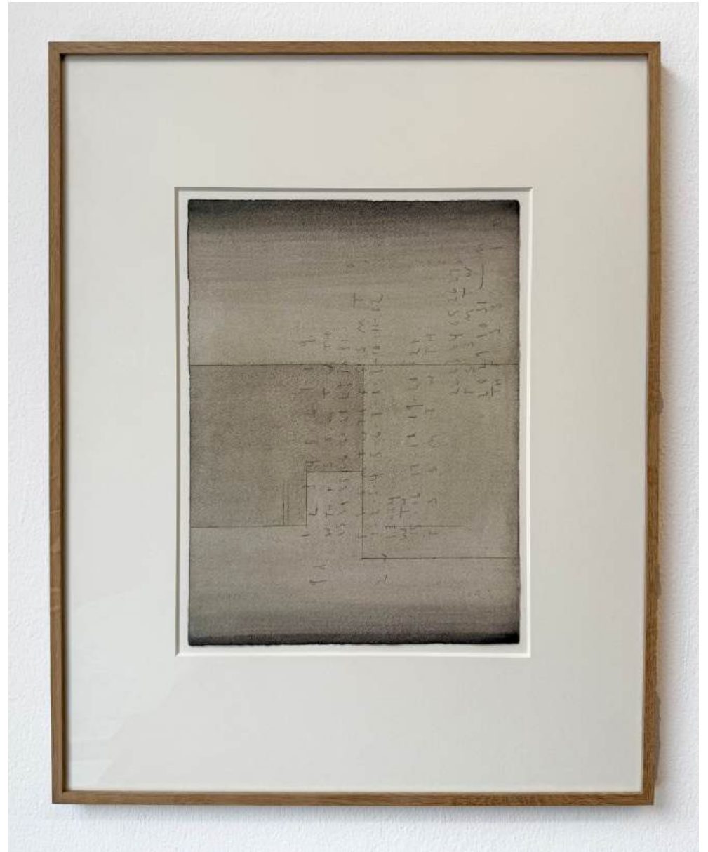
Simon Callery, „Days to Go“, 2025 Gouache and pencil on paper, 37.9 x 28.3 cm