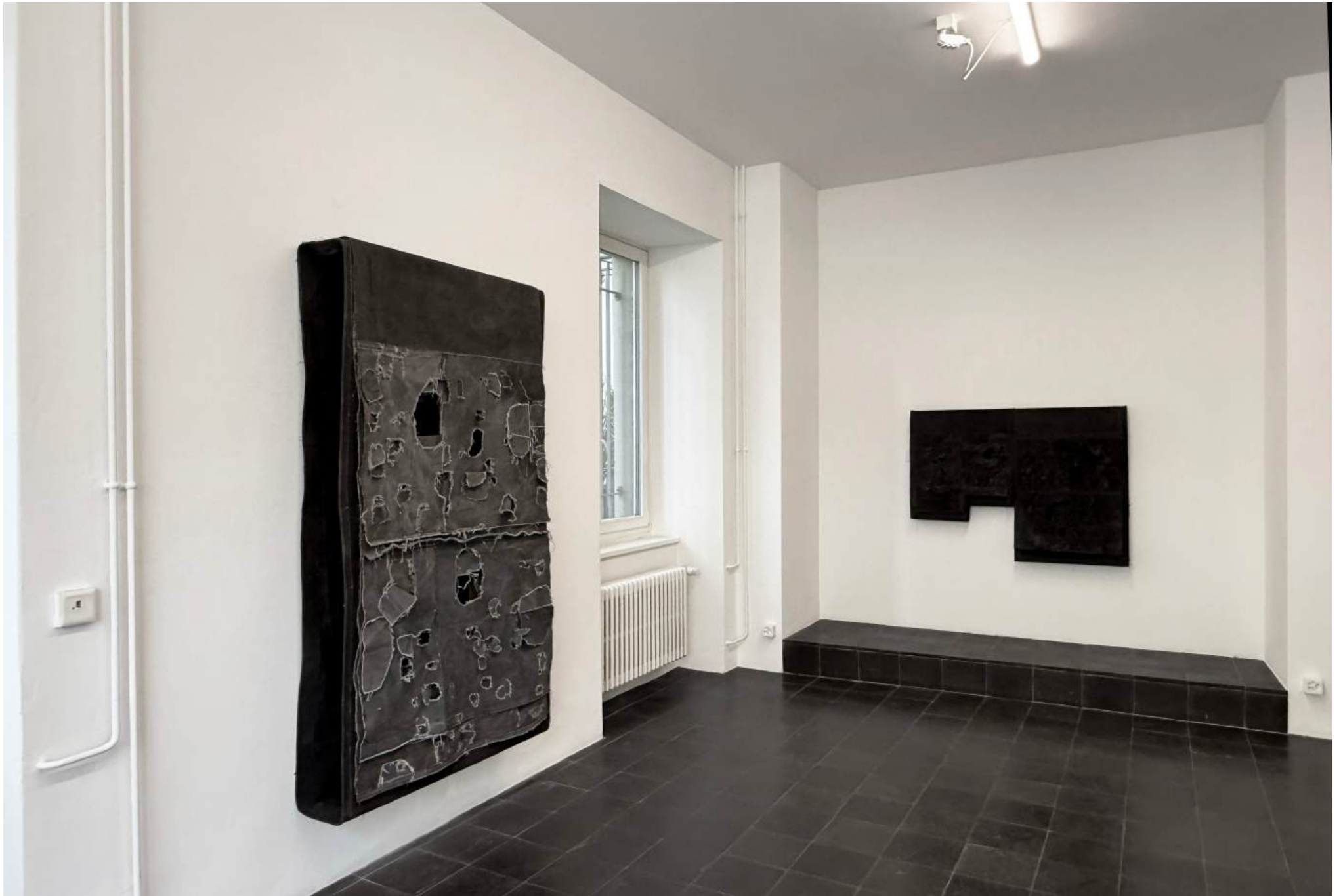
Simon Callery, „Limehouse Night Paintings“, Installation View, 2025