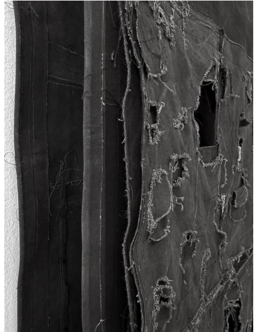
Simon Callery, „Limehouse Night Painting“, 2025, Details Canvas, distemper, thread, wood, 185 x 105 x 29 cm