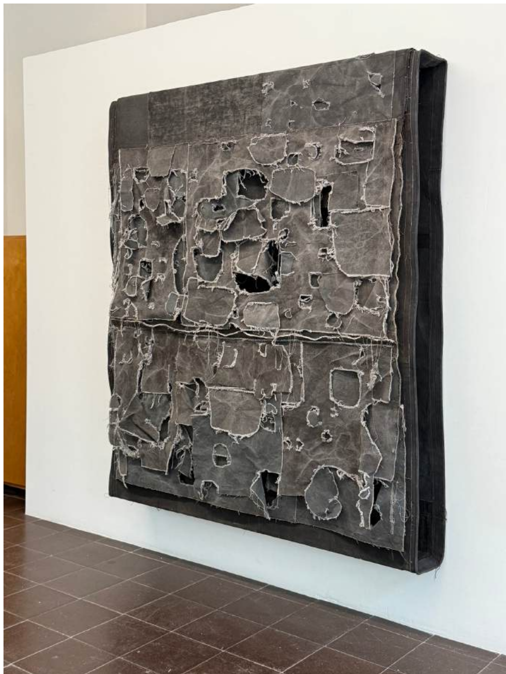
Simon Callery, „Limehouse Night Painting“, 2025 Canvas, distemper, thread, wood, 185 x 154 x 29 cm