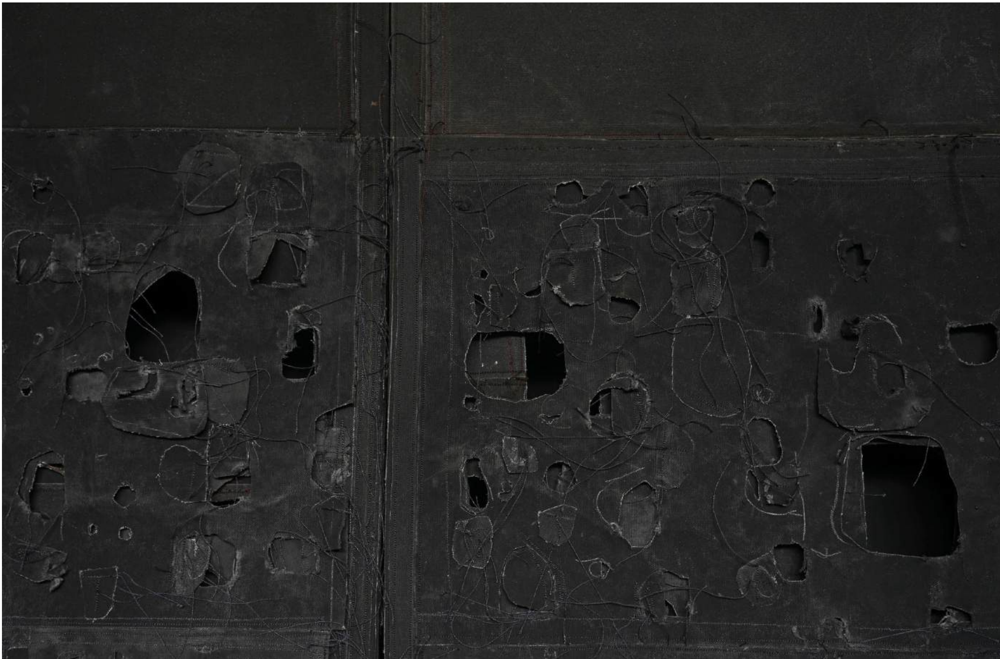
Simon Callery, „Limehouse Night Painting (steps)“, 2025, Detail Canvas, distemper, thread, aluminium, wood, 98 x 129 x 12 cm