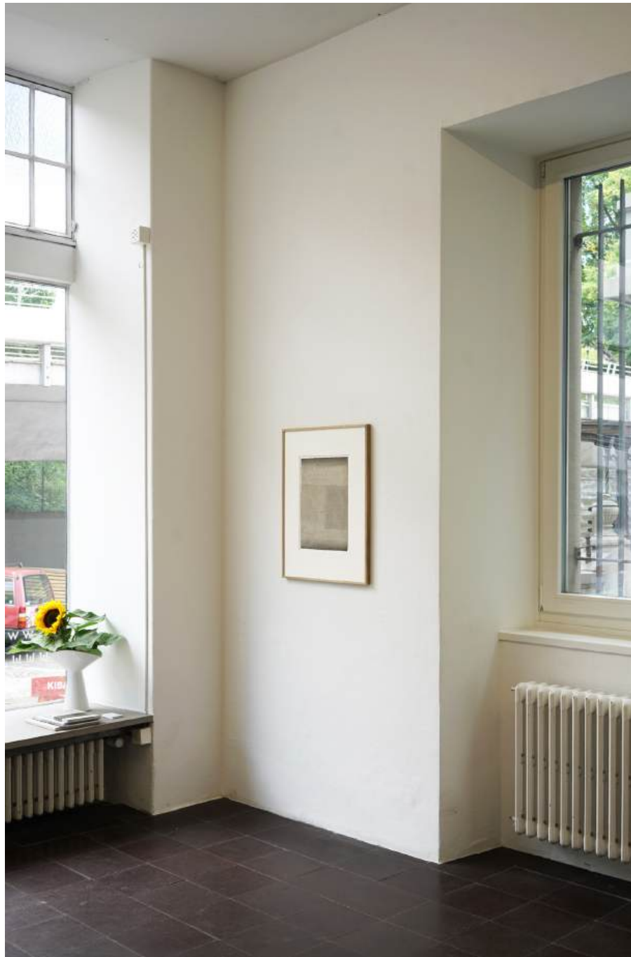
Simon Callery, „Limehouse Night Paintings“, Installation View, 2025