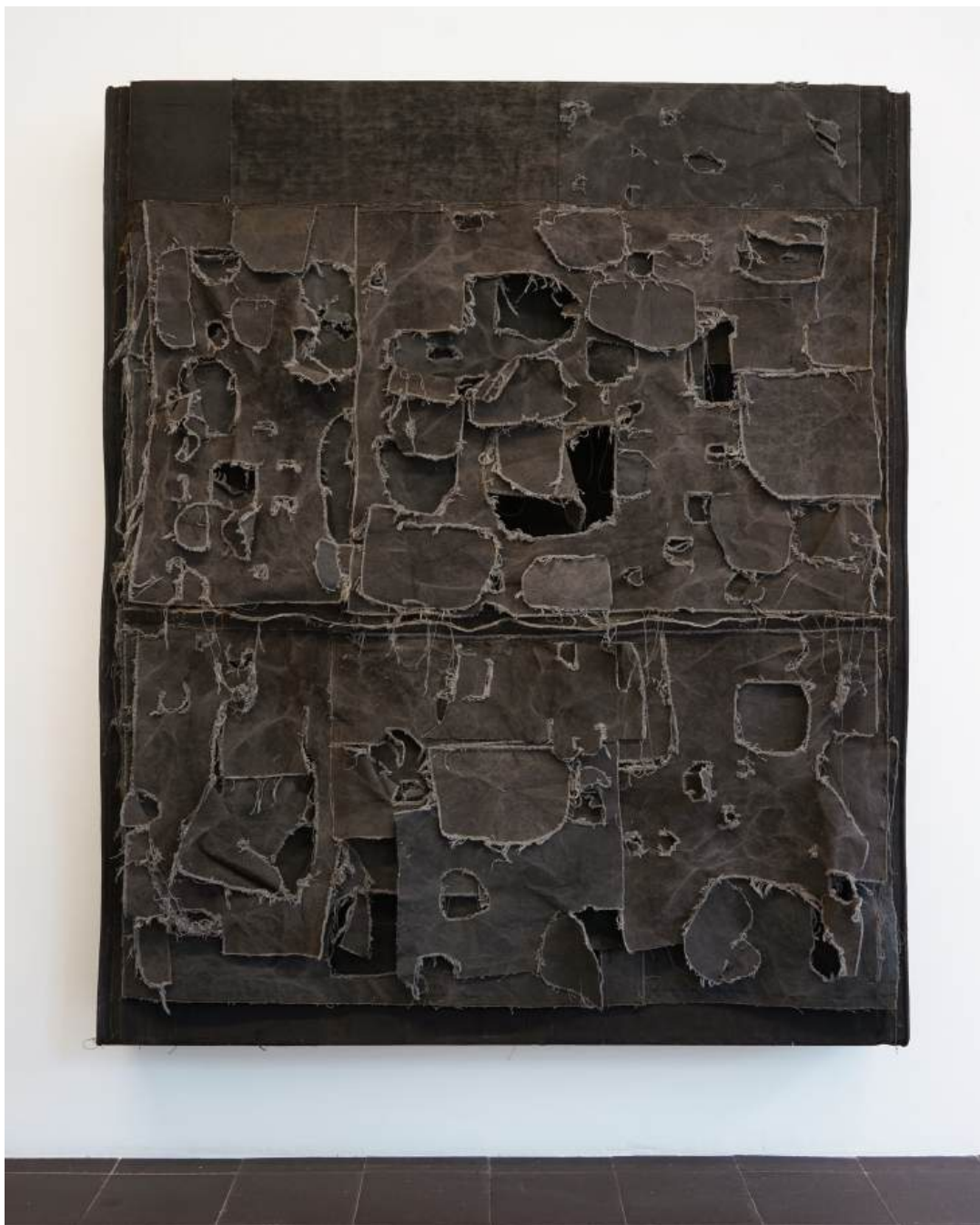
Simon Callery, „Limehouse Night Painting“, 2025 Canvas, distemper, thread, wood, 185 x 154 x 29 cm