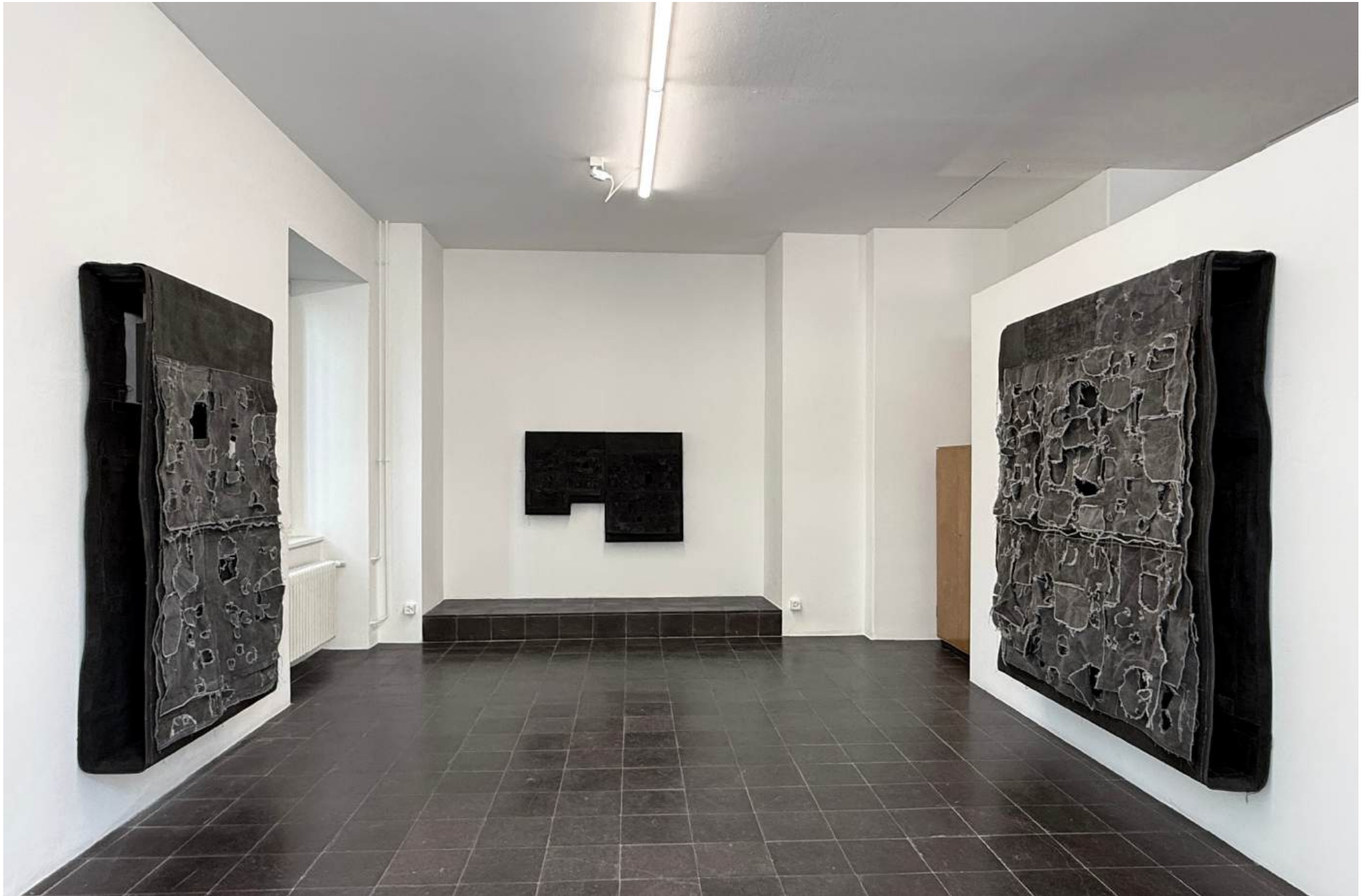
Simon Callery, „Limehouse Night Paintings“, Installation View, 2025