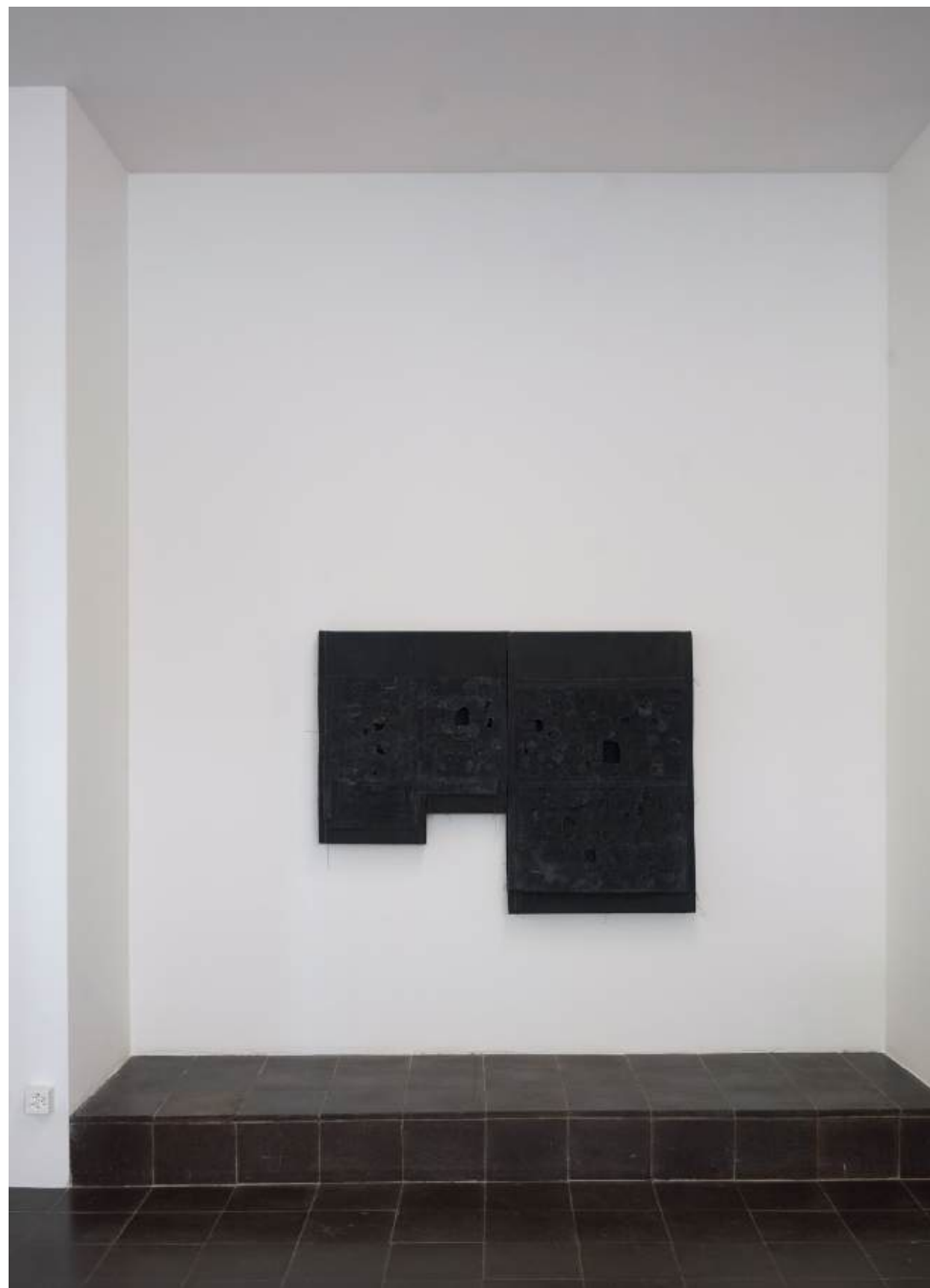
Simon Callery, „Limehouse Night Painting (steps)“, 2025 Canvas, distemper, thread, aluminium, wood, 98 x 129 x 12 cm