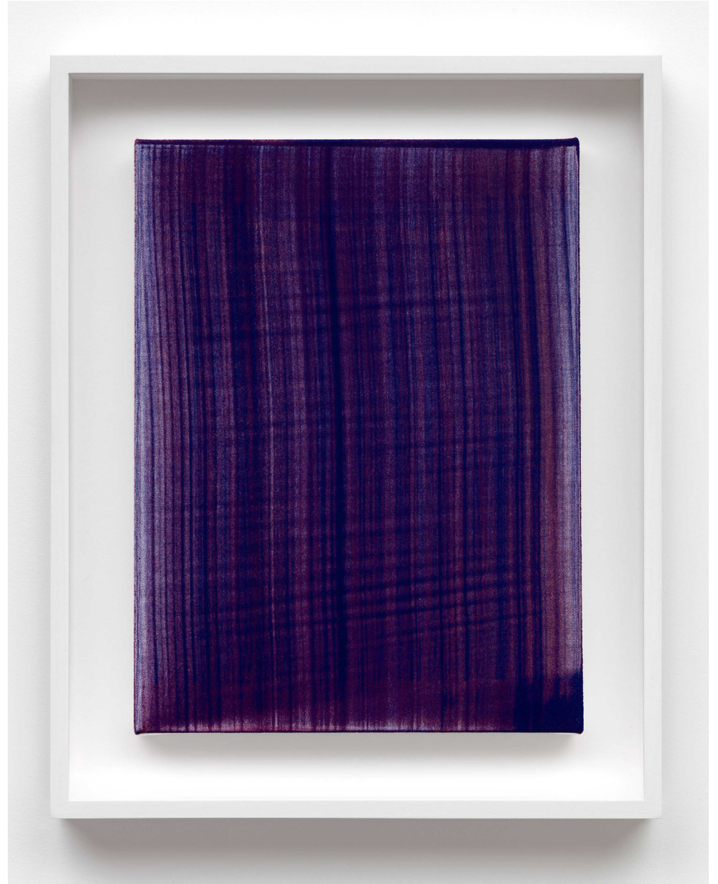
Paul Czerlitzki, Untitled, 2026 Acrylic on canvas, 50 x 40 cm / 61.5 x 51.5 cm