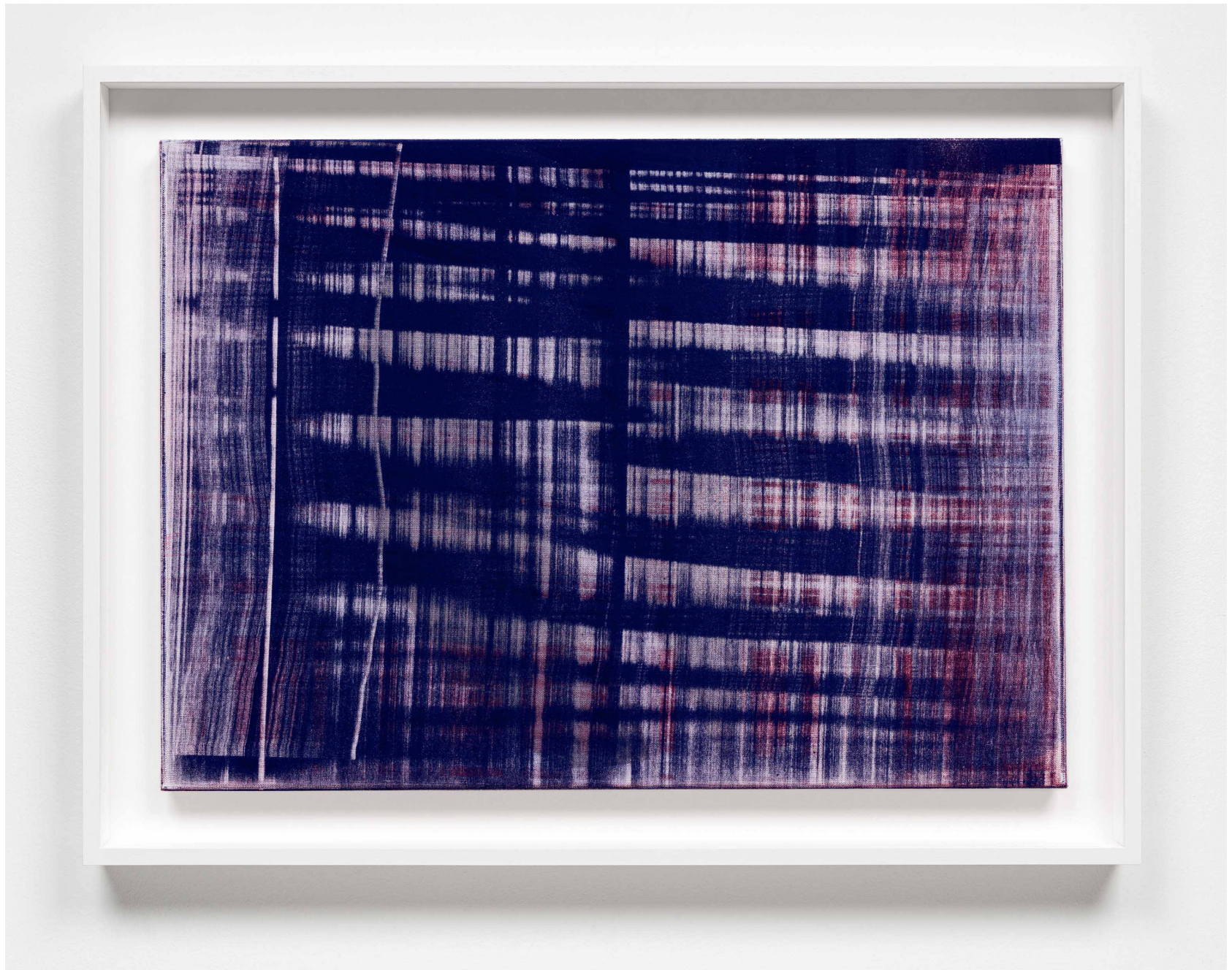
Paul Czerlitzki, Untitled, 2026 Acrylic on canvas, 50 x 70 cm / 61.5 x 81.5 cm