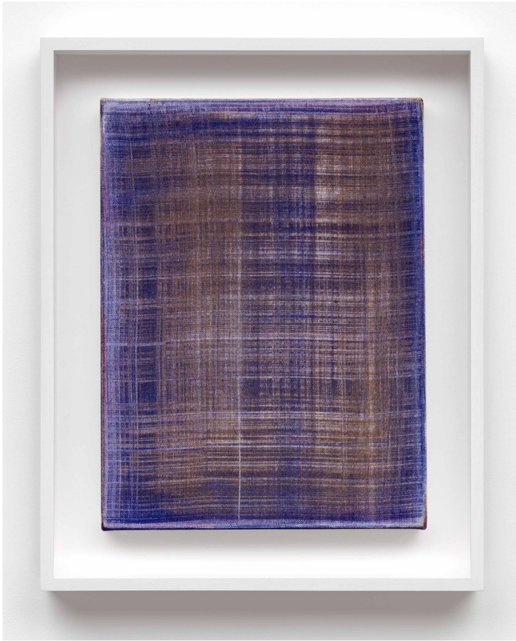
Paul Czerlitzki, Untitled, 2026 Acrylic on canvas, 50 x 40 cm / 61.5 x 51.5 cm