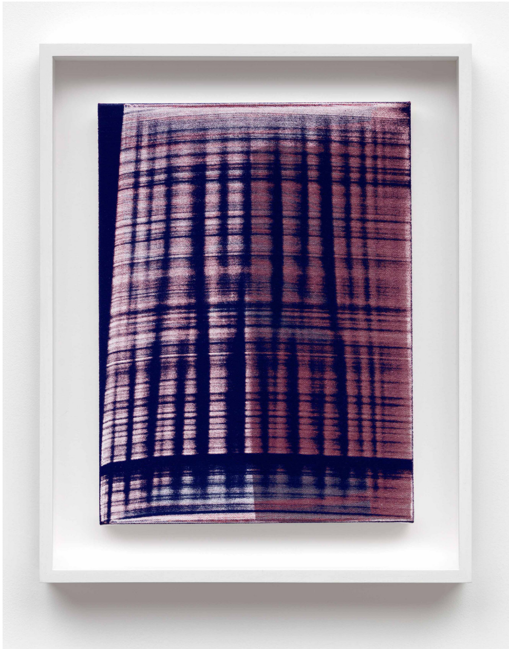
Paul Czerlitzki, Untitled, 2026 Acrylic on canvas, 50 x 40 cm / 61.5 x 51.5 cm