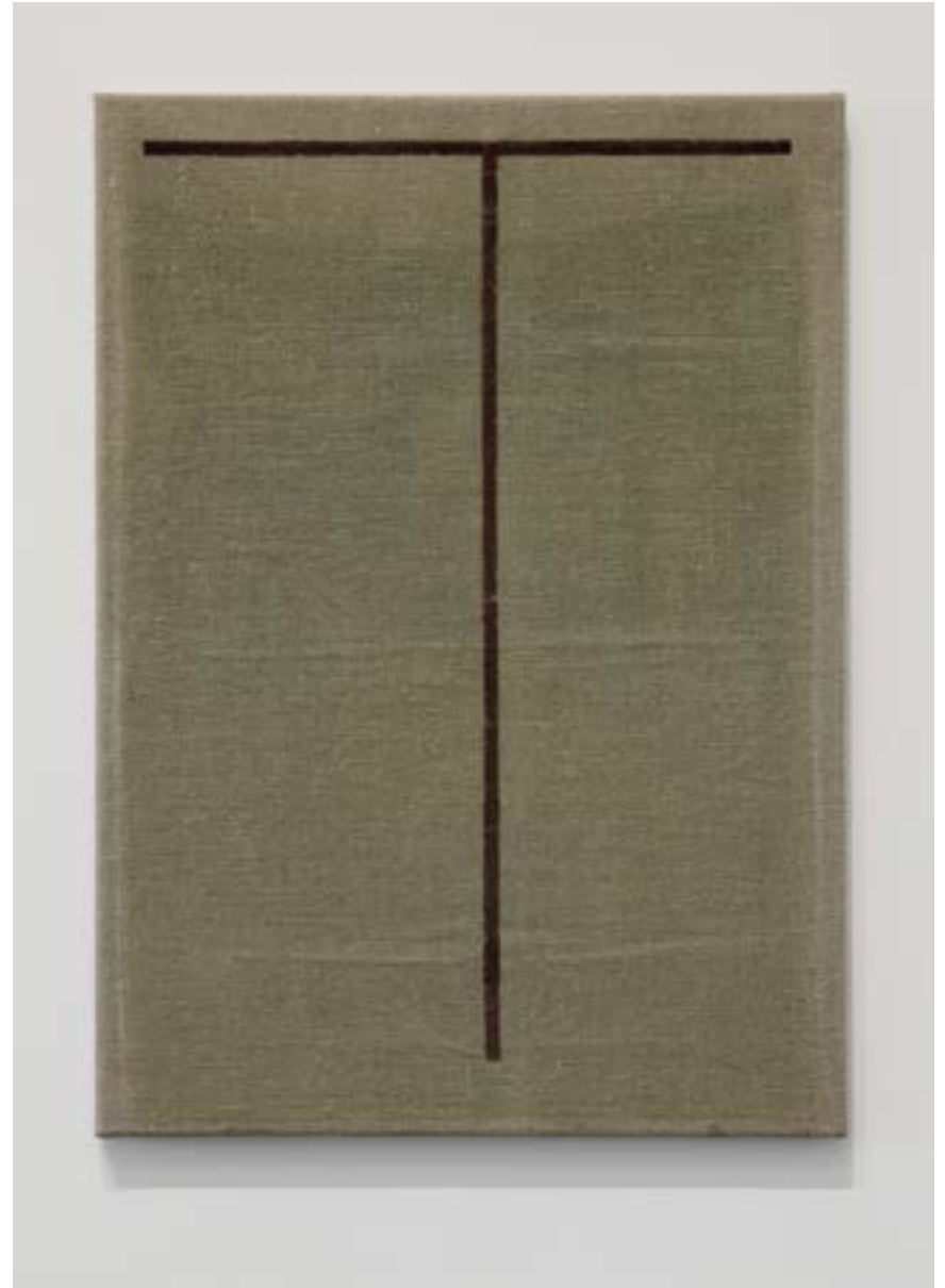
John Zurier, Late Summer 5 , 2020 Oil on linen, 70 x 50 cm