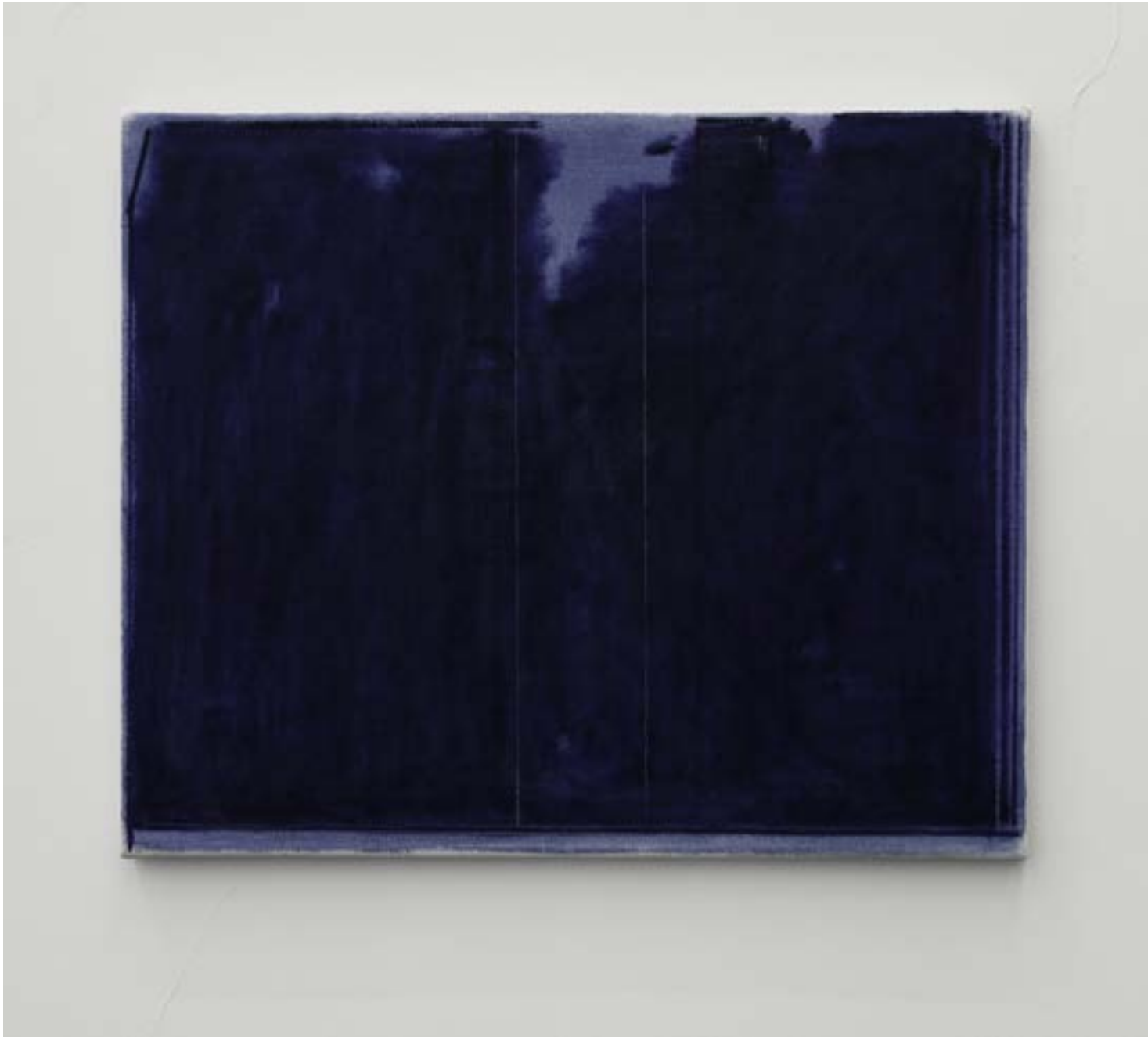
John Zurier, Late Summer 2 , 2021 Oil on linen, 50 x 50 cm