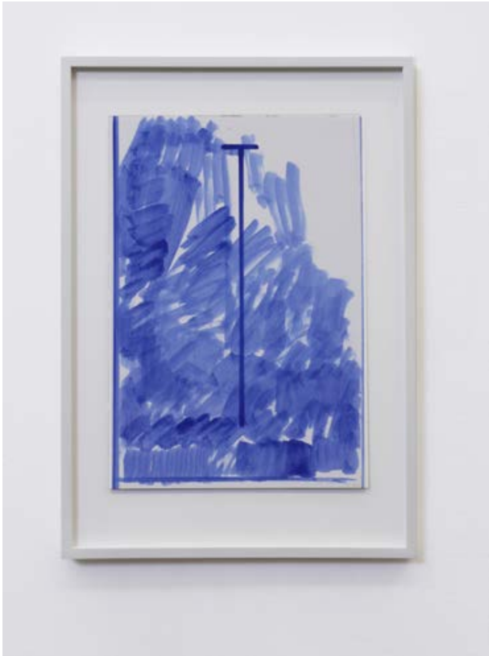
John Zurier, Untitled (Oct. 23, 2020) 1 , 2020 oil on paper, 36 x 25.5 cm