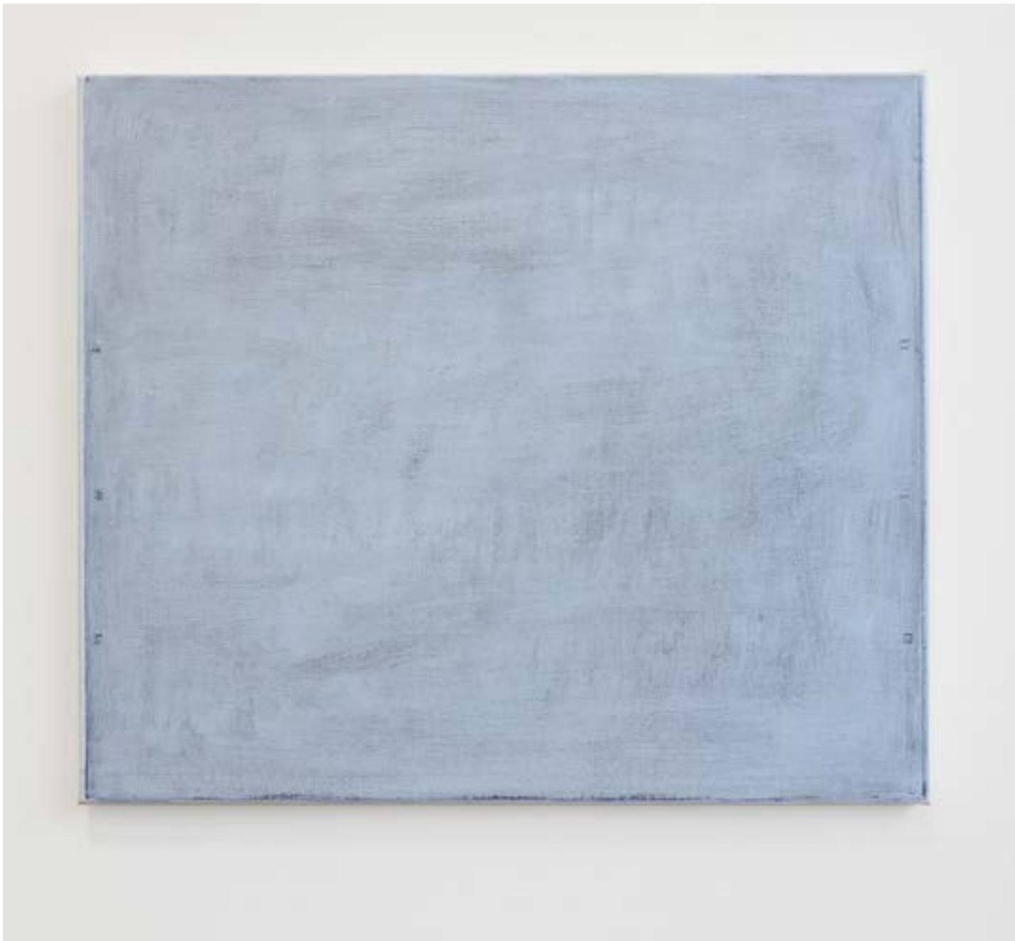
John Zurier, Late Summer 8 , 2020 Oil on linen, 60 x 70 cm