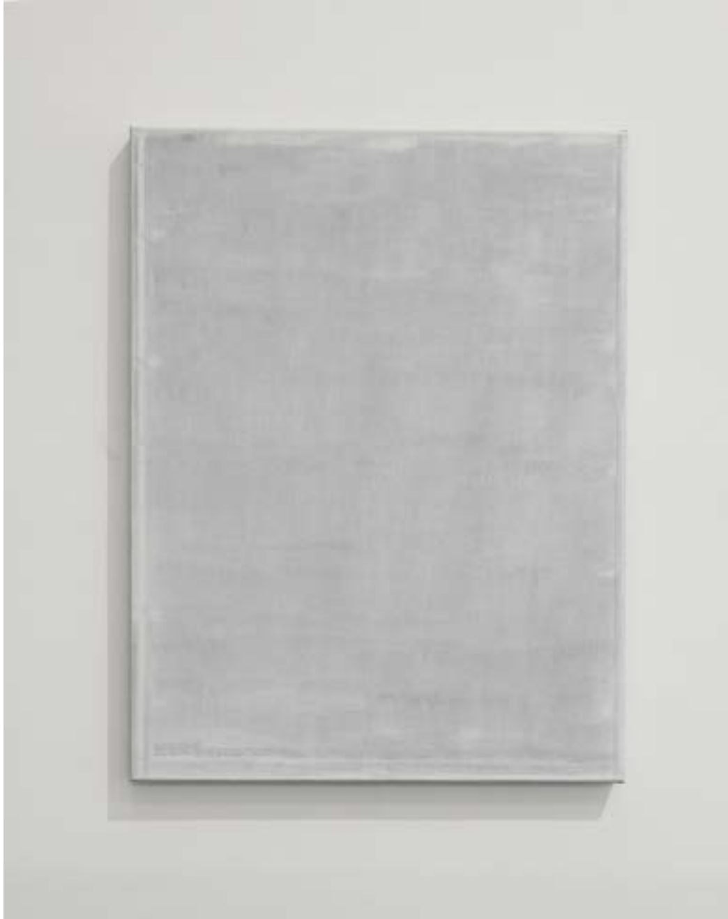
John Zurier, Late Summer 3 , 2020 Glue size tempera on linen, 80 x 60 cm