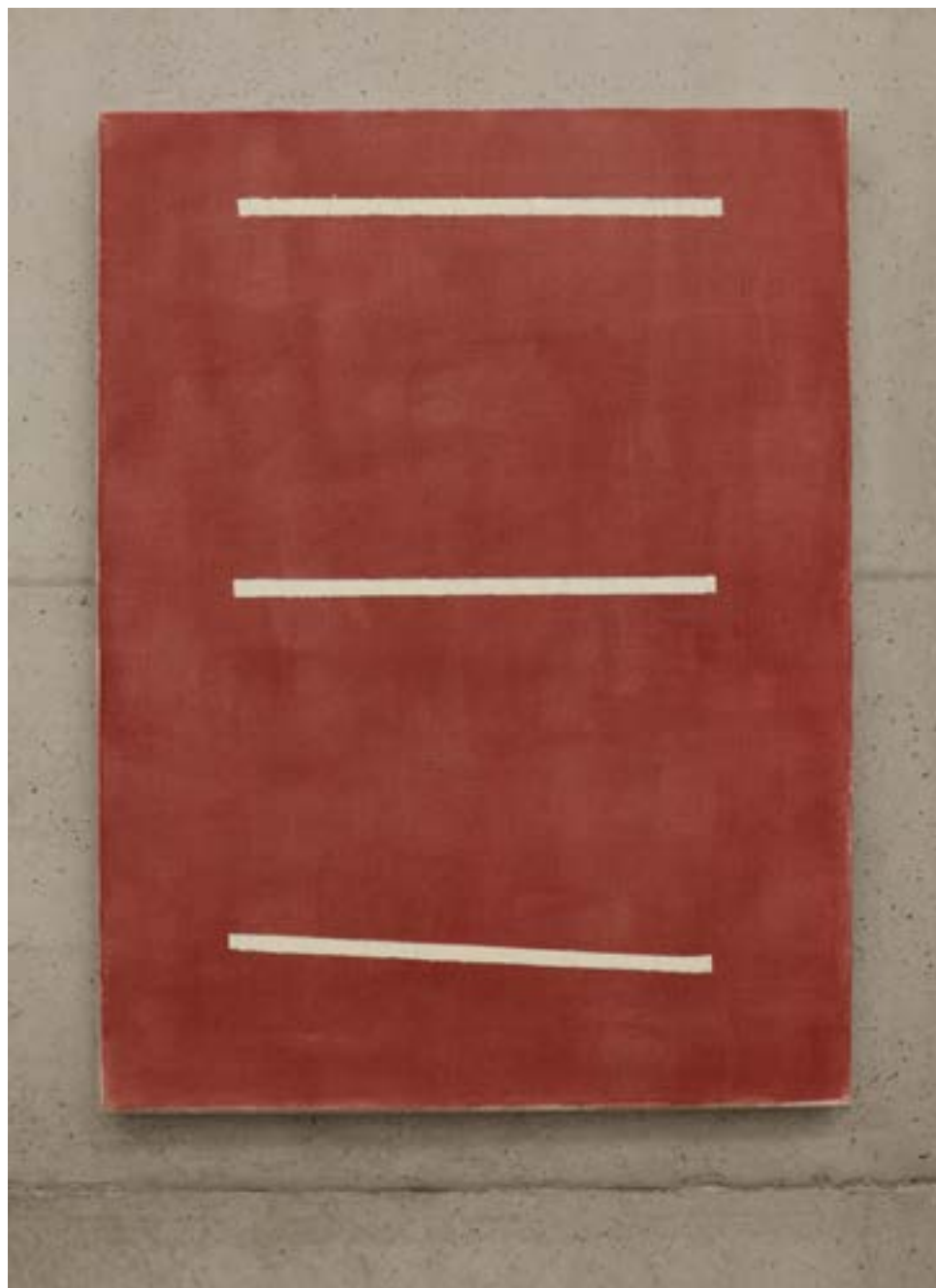
John Zurier, Late Summer 10 (STRAND) , 2021 Glue size tempera and oil on linen, 80 x 60 cm