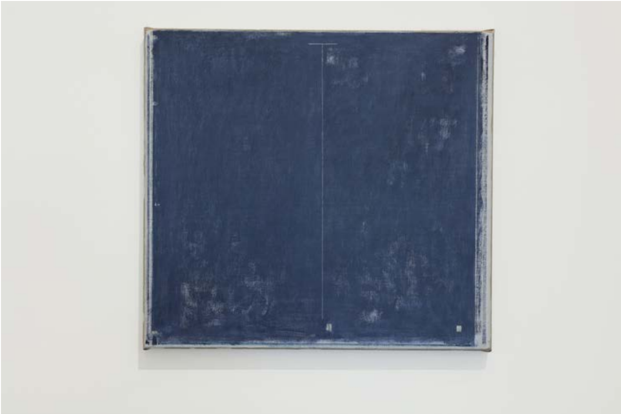
John Zurier, Late Summer 2 , 2021 Oil on linen, 50 x 50 cm