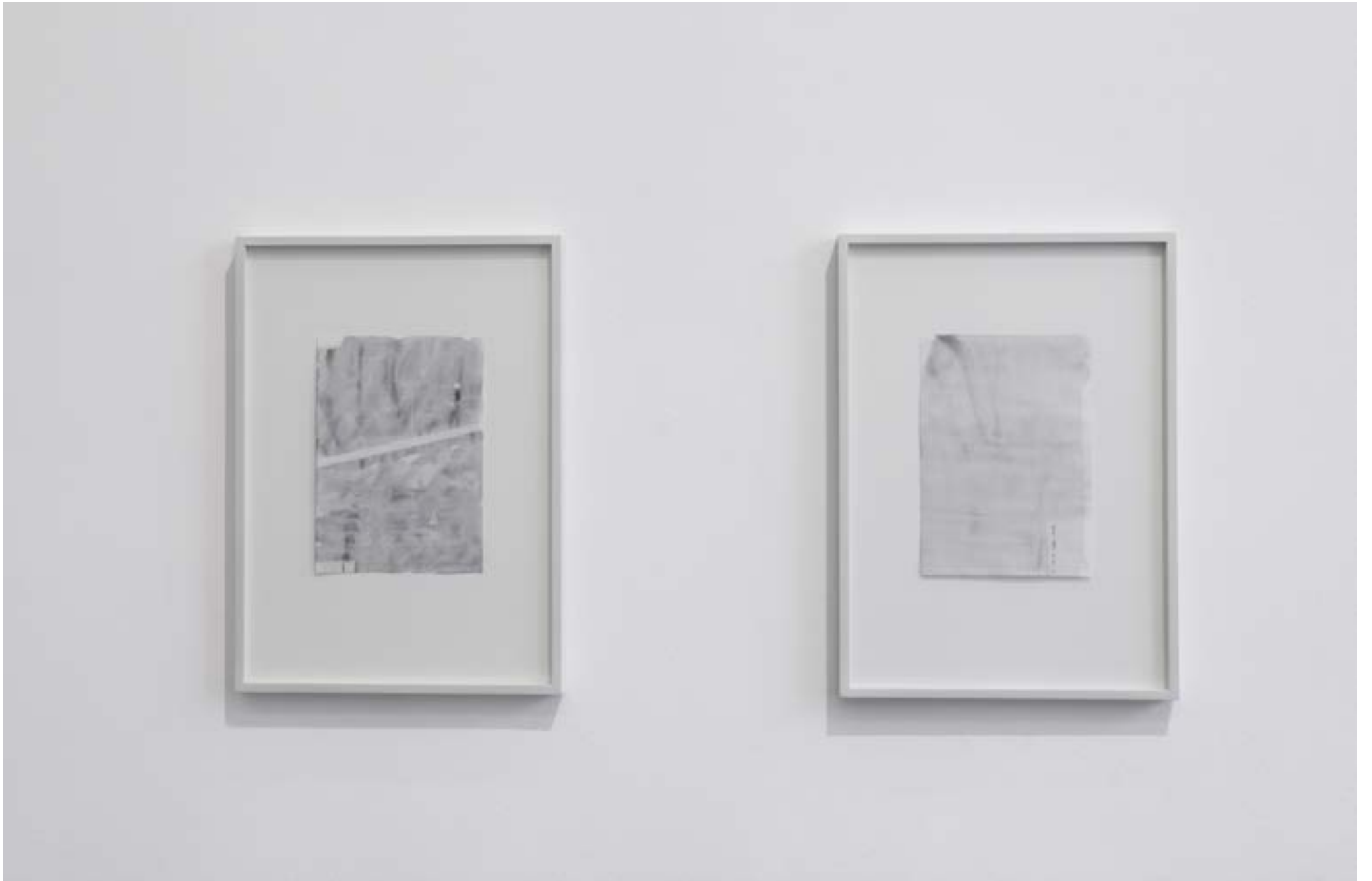
John Zurier, Indigo Ledger 2 , 2020, Indigo Ledger 1 , 2020 ink on lined paper, 25.1 x 17.7 cm, 46 x 32.6 cm framed