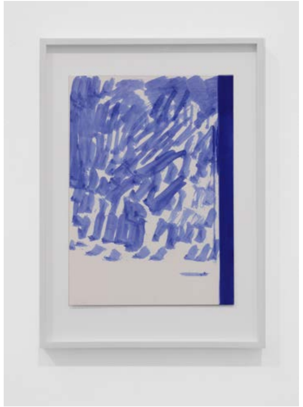
John Zurier, Untitled (Oct. 23, 2020) 2 , 2020 oil on paper, 36 x 25.5 cm