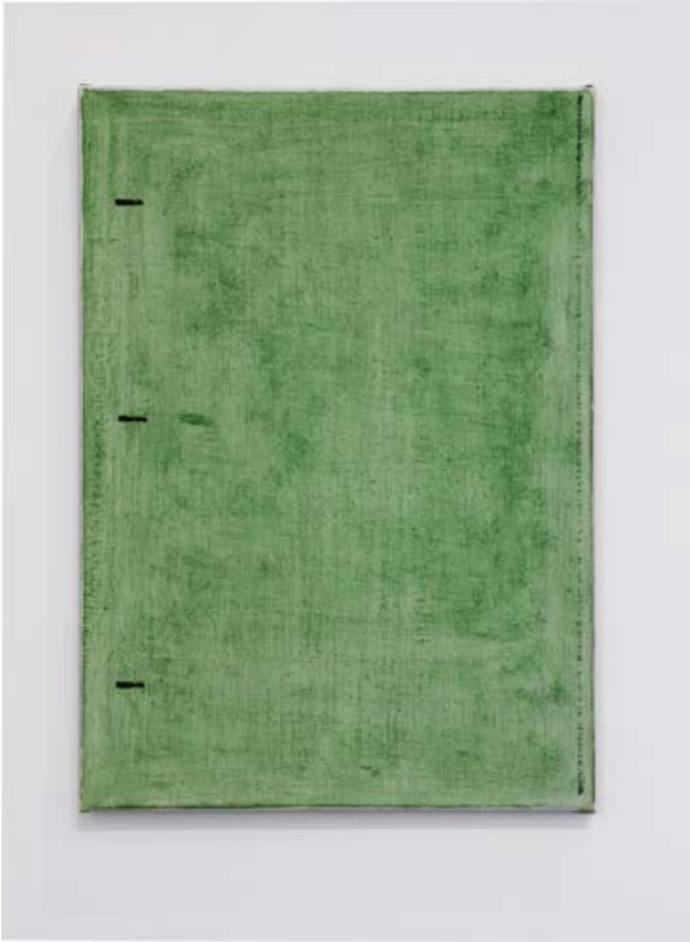
John Zurier, Late Summer 5 , 2020 Oil on linen, 70 x 50 cm