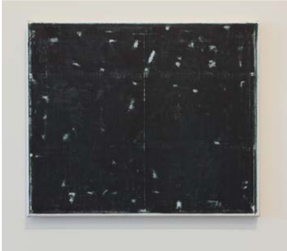
John Zurier, Late Summer 1 , 2020 Oil on linen, 50 x 60 cm