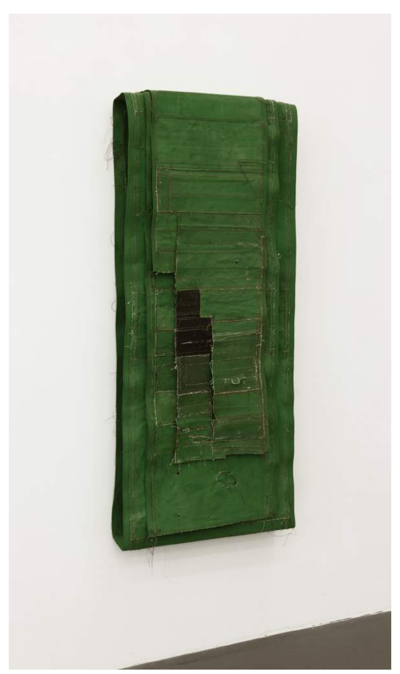
Simon Callery, Green Cover, 2023 Canvas, distemper, thread, aluminium wood, 140 x 56 x 15 cm