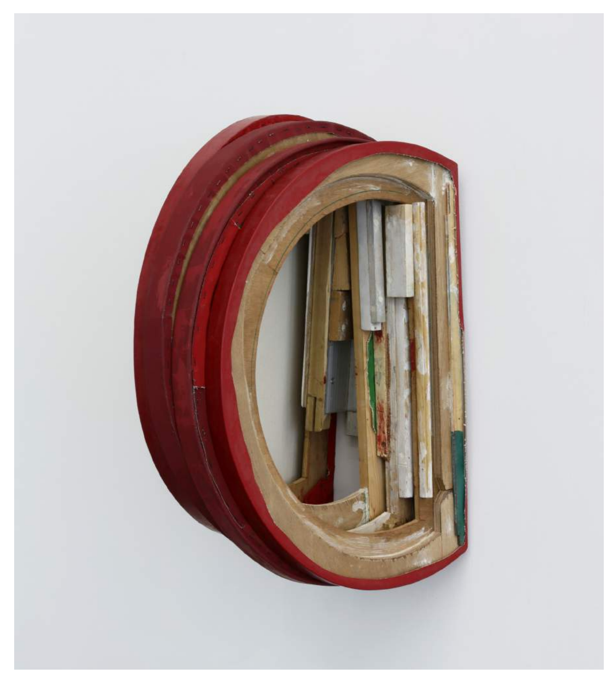
Simon Callery, Red Slip, 2014 Oil, distemper, acrylic, canvas, wood, aluminium, pencil, 74 \times 33 \times 54 cm