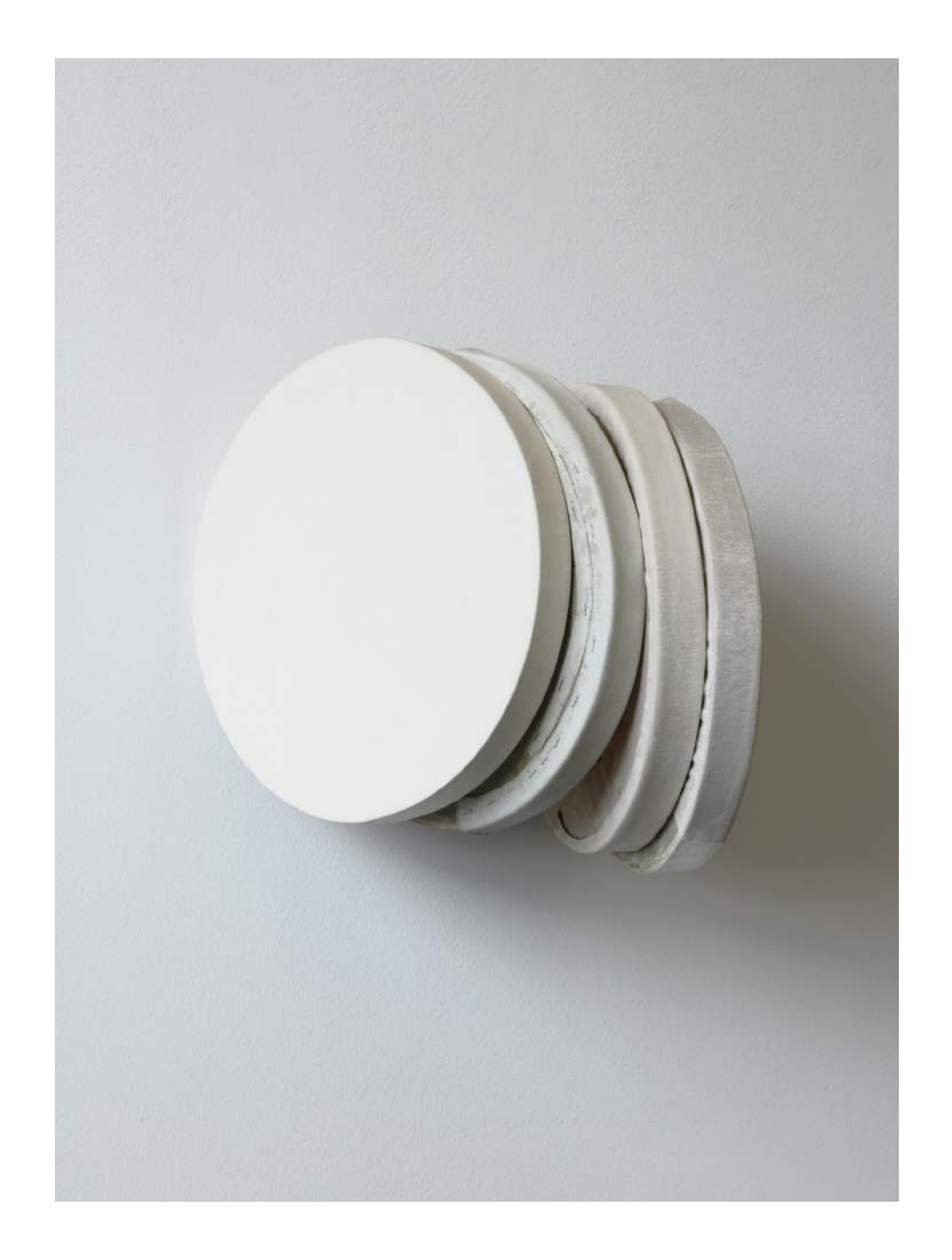
Simon Callery, Full Circle Pit Painting, 2020 Canvas, oil, acrylic, wood, aluminium, 40 x 40 x 43 cm