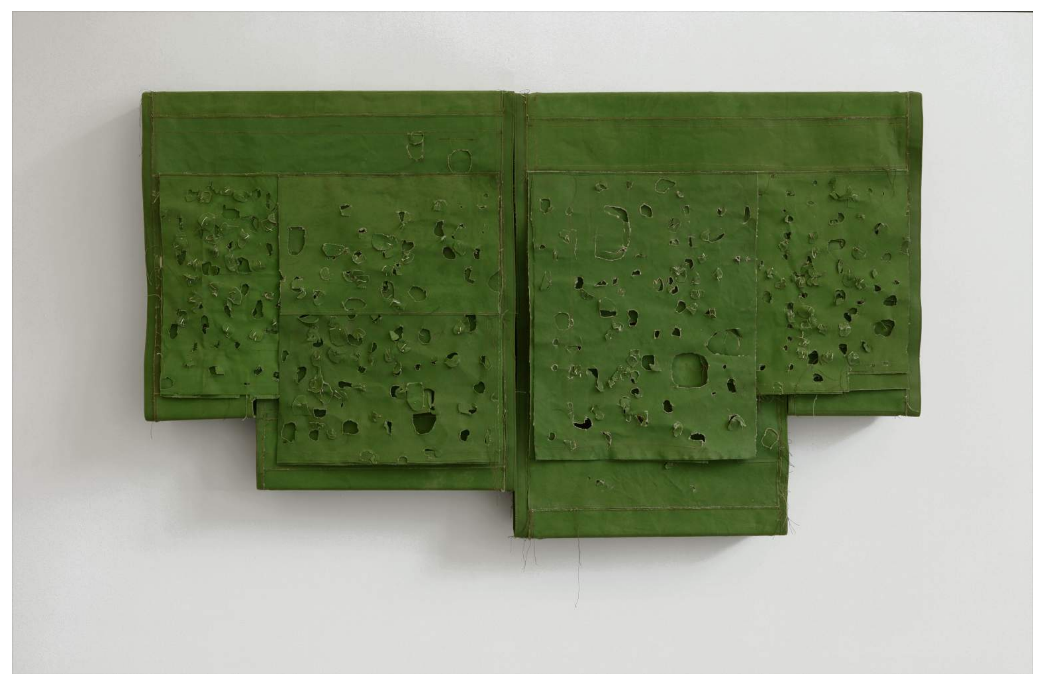
Simon Callery, Green Wing, 2023 Canvas, distemper, thread, aluminium, wood, 88 x 152 x 15 cm