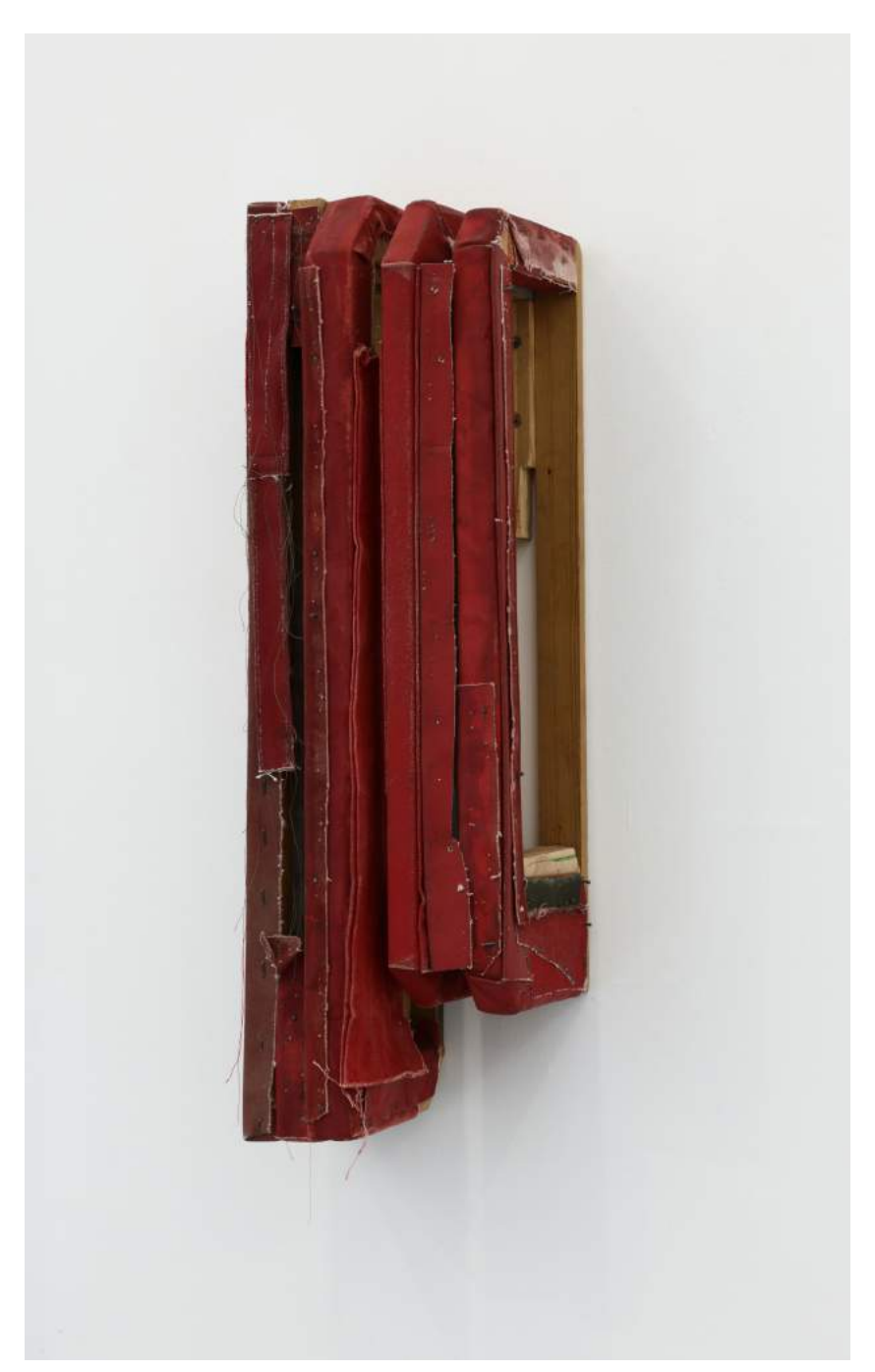
Simon Callery, Cadmium Red Deep Wallwork, 2011 Oil, distemper, acrylic, canvas, wood, aluminium, pencil, 74\times33\times54 cm