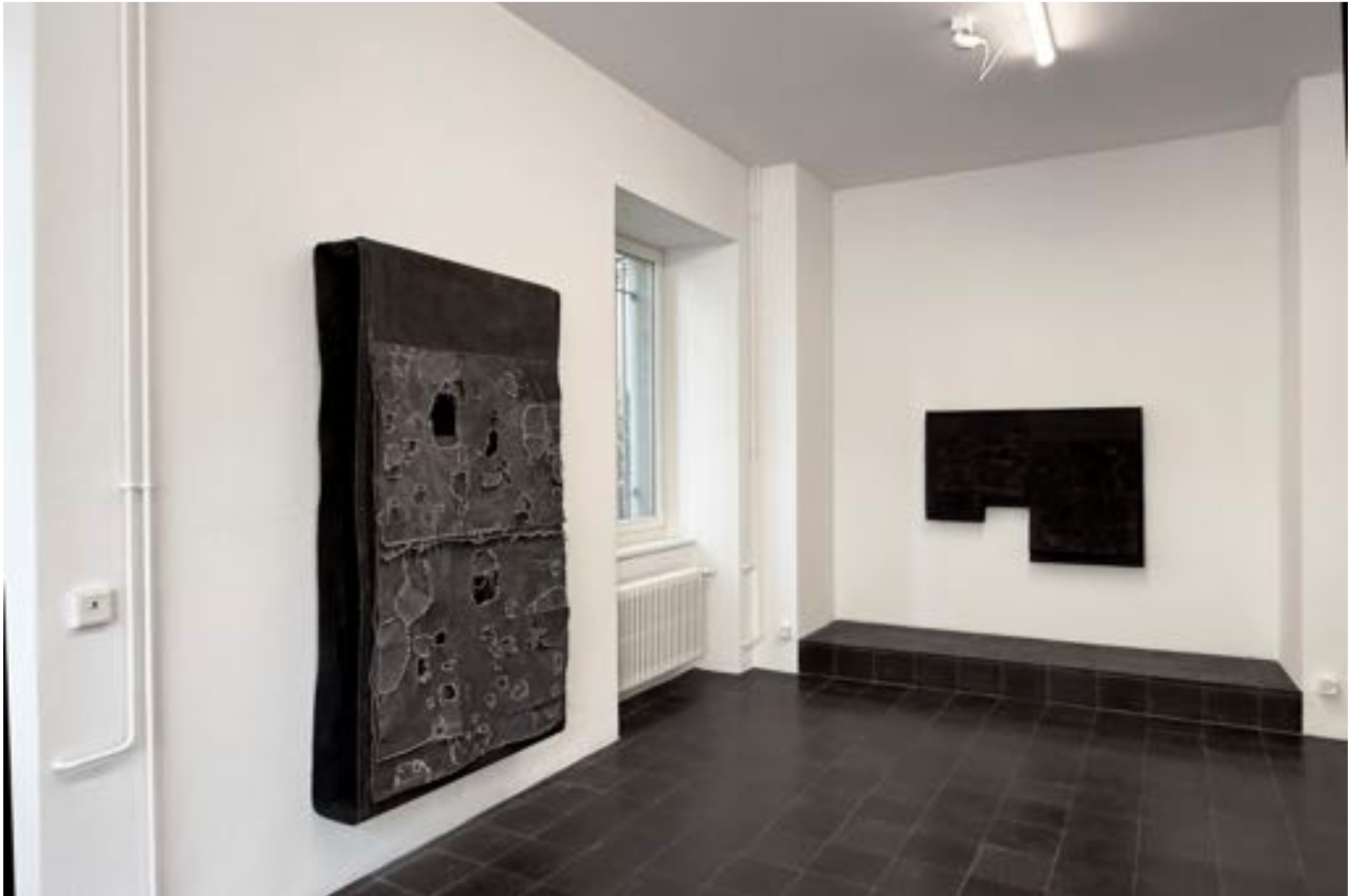
Simon Callery, „Limehouse Night Paintings“, Installation View, 2025