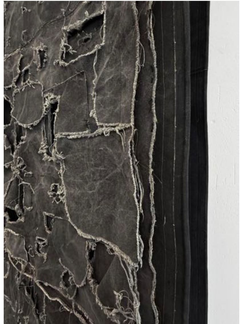
Simon Callery, „Limehouse Night Painting“, 2025, Details Canvas, distemper, thread, wood, 185 x 154 x 29 cm