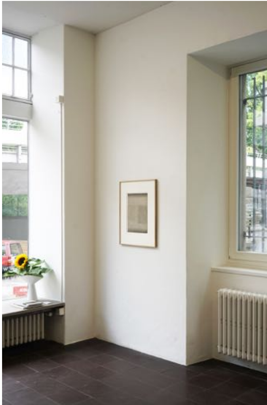
Simon Callery, „Limehouse Night Paintings“, Installation View, 2025