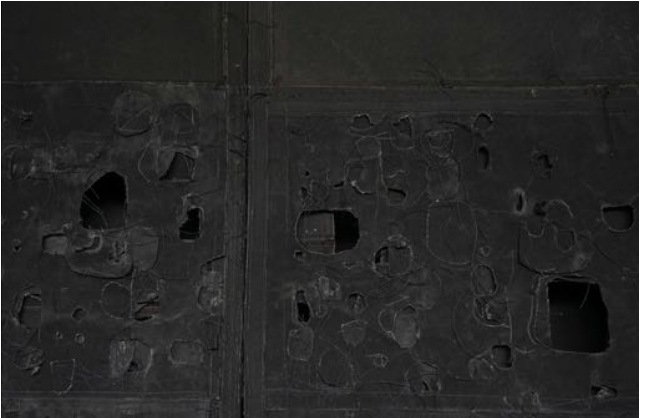
Simon Callery, „Limehouse Night Painting (steps)", 2025, Detail Canvas, distemper, thread, aluminium, wood, 98 x 129 x 12 cm