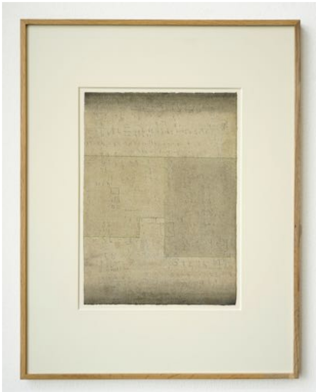
Simon Callery, „Drawing as Explanation“, 2025 Gouache and pencil on paper, 37.9 x 28.3 cm