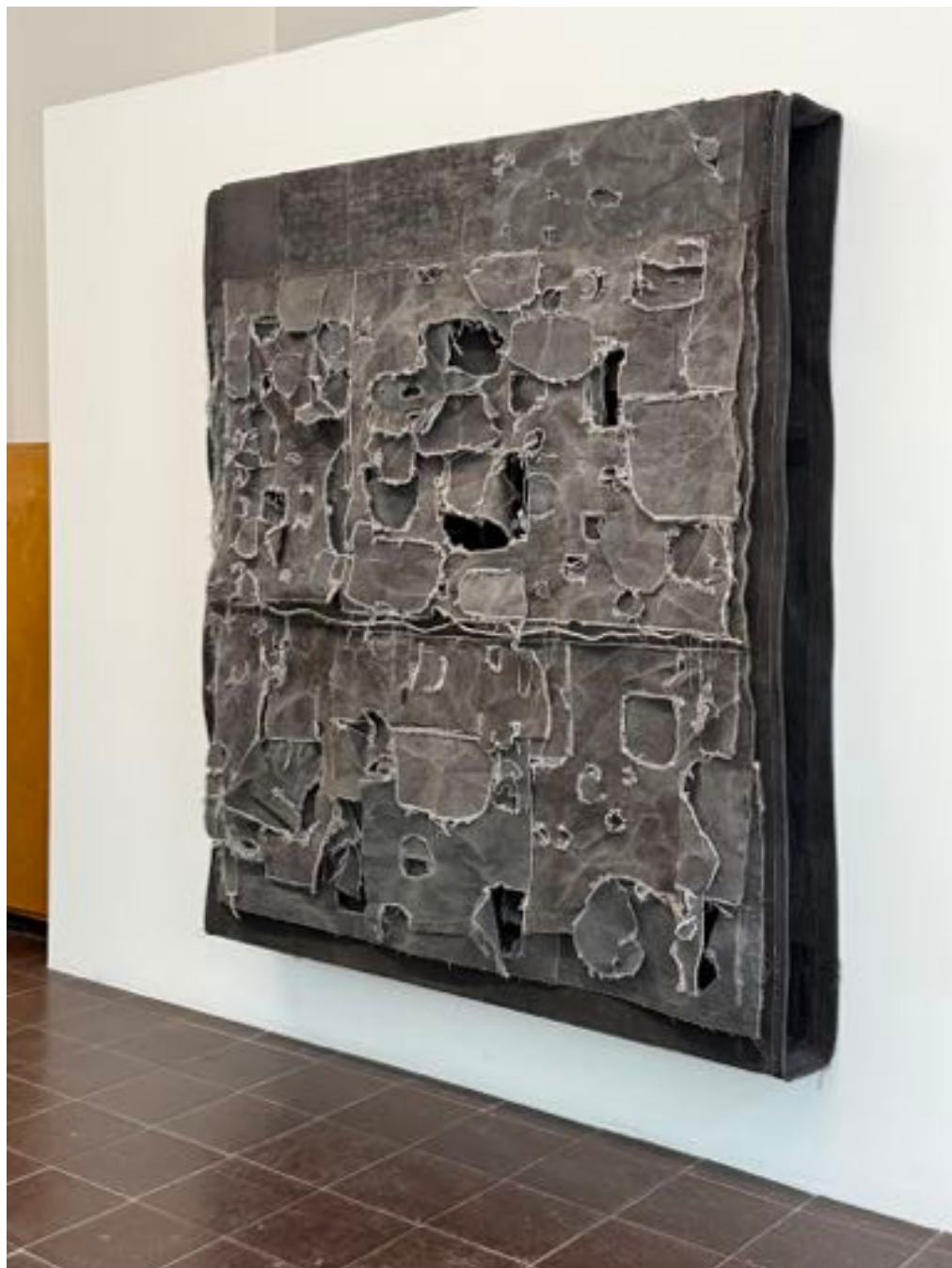
Simon Callery, „Limehouse Night Painting“, 2025 Canvas, distemper, thread, wood, 185 x 154 x 29 cm