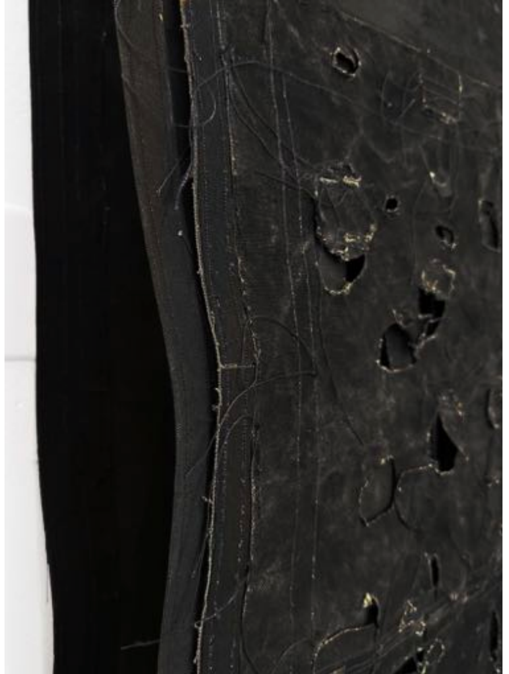
Simon Callery, „Limehouse Night Painting (steps)“, 2025 , Detail Canvas, distemper, thread, aluminium, wood, 98 x 129 x 12 cm